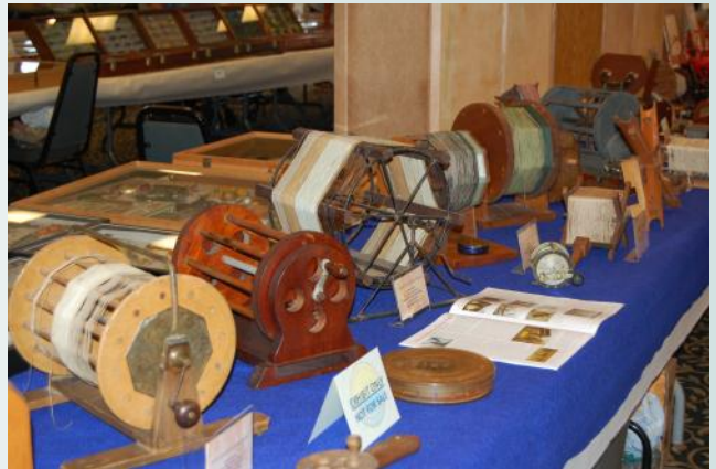
Part of the Phil Dawson line dryer display