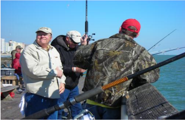
Friday fishing contest on the Springmaid Pier